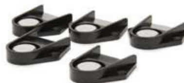
HI920005 Tag holders with tags (5)

Install tags near your sampling points for quick and easy iButton® readings. Each tag contains a computer chip with a unique identification code encased in stainless steel. You can install a practically unlimited amount of tags.